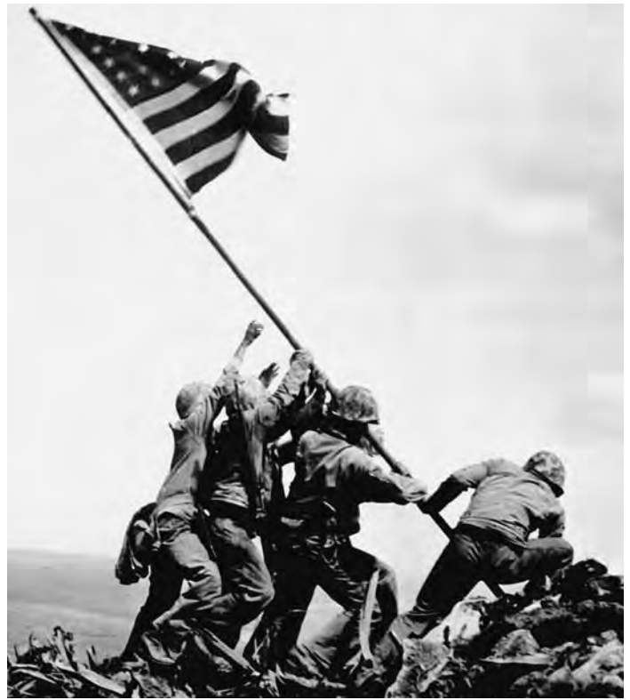
“Raising the Flag on Iwo Jima,” photographed by Joe Rosenthal, Associated Press, 1945.

From 1959 to 1975, United States Armed Forces and the South Vietnamese Army fought against the North Vietnamese in the Vietnam War. The United States supported the democratic government in the south of the country to help it resist pressure from the communist north. The war ended in 1975 with the temporary separation of the country into communist North Vietnam and democratic South Vietnam. In 1976, Vietnam was under total communist control.