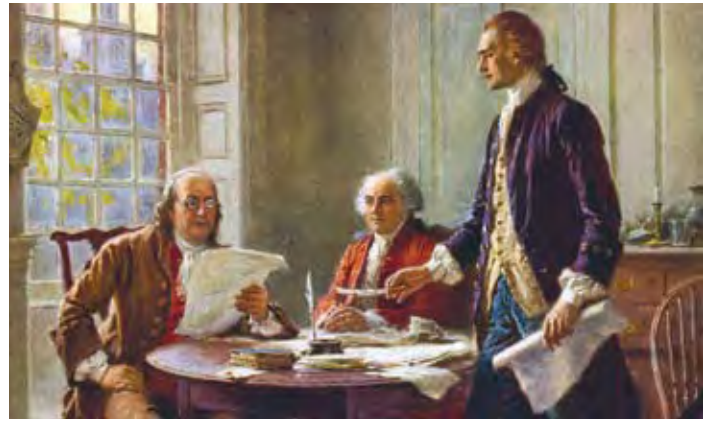
Benjamin Franklin, John Adams, and Thomas Jefferson in “Writing the Declaration of Independence, 1776,” by Jean Leon Gerome Ferris.

The Declaration of Independence lists three rights that the Founding Fathers considered to be natural and “unalienable.” They are the right to life, liberty, and the pursuit of happiness. These ideas about freedom and individual rights were the basis for declaring America’s independence. Thomas Jefferson and the other Founding Fathers believed that people are born with natural rights that no government can take away. Government exists to protect these rights. Because the people voluntarily give up power to a government, they can take that power back. The British government was not protecting the rights of the colonists, so the colonies took back their power and separated from Great Britain.