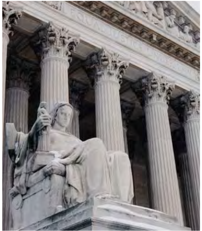
The Contemplation of Justice statue outside the U.S. Supreme Court building in Washington, D.C.

The judicial branch is one of the three branches of government. The Constitution established the judicial