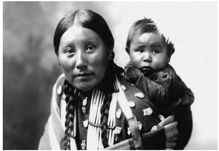
American Indian woman and her baby in 1899.

On September 11, 2001, four airplanes flying out of U.S. airports were taken over by terrorists from the Al-Qaeda network of Islamic extremists. Two of the planes crashed into the World Trade Center’s Twin Towers in New York City, destroying both buildings. One of the planes crashed into the Pentagon in Arlington, Virginia. The fourth plane, originally aimed at Washington, D.C., crashed in a field in Pennsylvania. Almost 3,000 people died in these attacks, most of them civilians. This was the worst attack on American soil in the history of the nation.