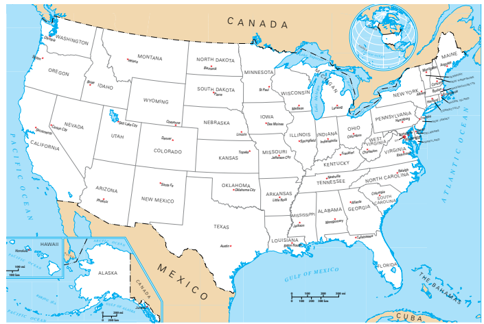
Map of the United States including state capitals.

The Constitution did not establish political parties. President George Washington specifically warned against them. But early in U.S. history, two political