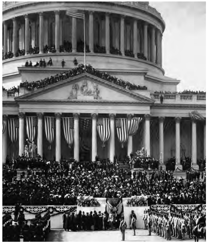
The inauguration of President Theodore Roosevelt on March 4, 1905.

Barack Obama is the 44th president of the United States. He won the presidential election of 2008 and became the first African American president of the United States. As president, he is the head of the executive branch. As commander in chief, he is also in charge of the military. Obama was born in Hawaii on August 4, 1961. He graduated from Columbia University in New York. Obama also studied law and graduated from Harvard University in Massachusetts. He served as a U.S. senator for the state of Illinois before being elected president. President Obama's wife, called "the First Lady," is Michelle Obama.