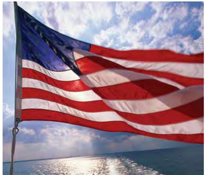
The American flag is an important symbol of the United States.

When the United States became an independent country, the Constitution gave Congress the power to establish a uniform rule of naturalization. Congress made rules about how immigrants could become citizens. Many of these requirements are still valid today, such as the requirements to live in the United States for a specific period of time, to be of good