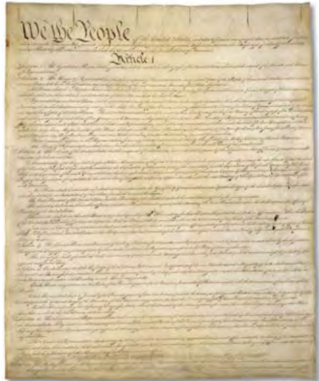
The Constitution of the United States.

The Constitution, written in 1787, created a new system of U.S. government—the same system we have today. James Madison was the main writer of the Constitution. He became the fourth president of the United States. The U.S. Constitution is short, but it defines the principles of government and the rights of citizens in the United States. The document has a preamble and seven articles. Since its adoption, the Constitution has been amended (changed) 27 times. Three-fourths of the states (9 of the original 13) were required to ratify (approve) the Constitution. Delaware was the first state to ratify the Constitution on December 7, 1787. In 1788, New Hampshire was the ninth state to ratify the Constitution. On March 4, 1789, the Constitution took effect and Congress met for the first time. George Washington was inaugurated as president the same year. By 1790, all 13 states had ratified the Constitution.