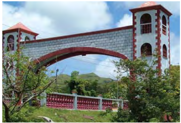
Old Spanish Bridge in Umatac, Guam.

The northern border of the United States stretches more than 5,000 miles from Maine in the East to Alaska in the West. There are 13 states on the border with Canada. The Treaty of Paris of 1783 established the official boundary between Canada and the United States after the Revolutionary War. Since that time, there have been land disputes, but they have been resolved through treaties. The International Boundary Commission, which is headed by two commissioners, one American and one Canadian, is responsible for maintaining the boundary.