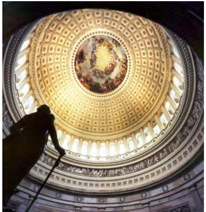
The Rotunda of the U.S. Capitol.

Congress is divided into two parts—the Senate and the House of Representatives. Because it has two “chambers,” the U.S. Congress is known as a “bicameral” legislature. The system of checks and balances works in Congress. Specific powers are assigned to each of these chambers. For example, only the Senate has the power to reject a treaty signed by the president or a person the president chooses to serve on the Supreme Court. Only the House of Representatives has the power to introduce a bill that requires Americans to pay taxes.