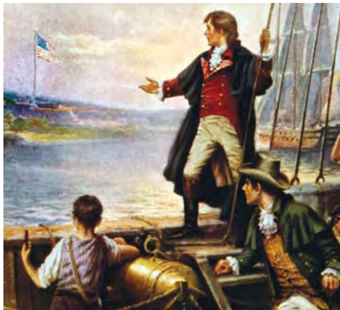
In "The Star-Spangled Banner," by Percy Moran, Francis Scott Key reaches toward the flag flying over Fort McHenry.

Many Americans celebrate national or federal holidays. These holidays often honor people or events in our American heritage. These holidays are "national" in a legal sense only for federal institutions and in the District of Columbia. Typically, federal offices are closed on these holidays. Each state can decide whether or not to celebrate the holiday. Businesses, schools, and commercial establishments may choose whether or not to close on these days. Since 1971, federal holidays are observed on Mondays except for New Year's Day, Independence Day, Veterans Day, Thanksgiving, and Christmas.